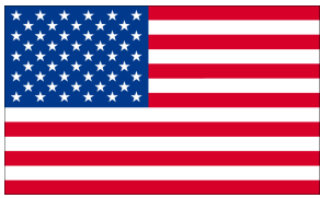
THE UNITED STATES OF AMERICA